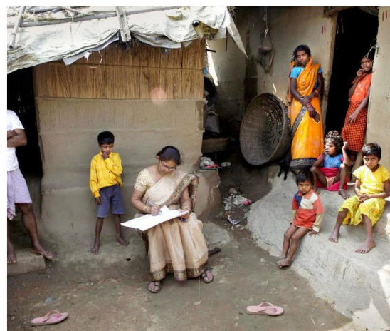
Numbering people: A Census worker collects information on the first day of the national Census at Ramsingh Chapori village, east of Guwahati, India, on April 1, 2010.

The Census is a Union list subject while The Census Act, 1948 is the key legislation governing the Census process. It authorises the Central government to undertake Census operations and appoint a Census Commissioner to supervise the entire exercise. The Centre also appoints Directors of Census Operations to supervise the Census within several States, while the State governments may appoint Census officers. The staff for conducting the Census is provided by the local authorities of a State, which predominantly consists of teachers. Since 1971, Census operations have