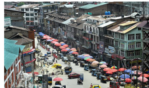
Regular day: The weekly flea market in Srinagar on Sunday as calm returns to Jammu and Kashmir.

Around 500 people had to take refuge at multiple centres, including two schools in Baramulla, after the Pakistan Army resorted to heavy shelling. Scores of children who missed school were excited to rejoin their school. "We study in a school in Uri tehsil. I have not seen my classmates for many days now. I am excited to go back to school once it reopens. I pray shelling doesn't take place again,"