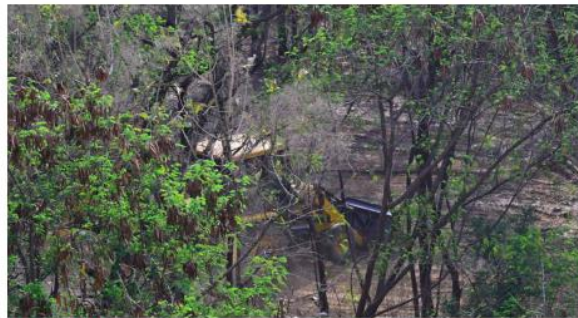
Nature's loss: An excavator seen on the 400-acre land in Kancha Gachibowli, in Hyderabad last month.