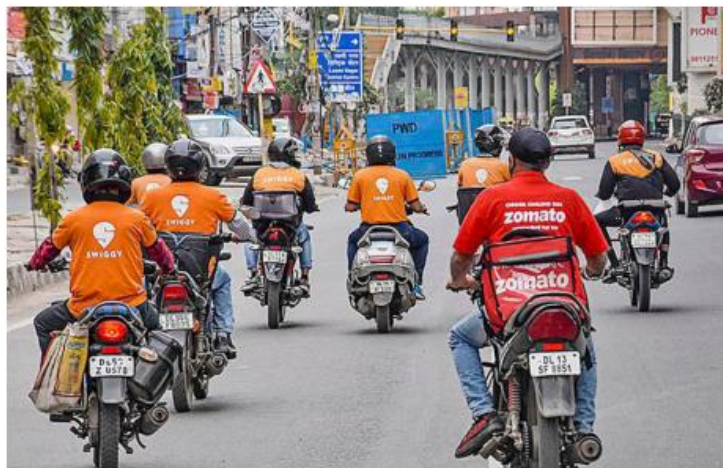
Voicing concerns: At the roundtable held in Delhi on Thursday, gig workers highlighted the 'harsh realities' they face in the sector.

The meeting, titled "Current developments, challenges and way forward", organised by a non-governmental organisation, Janpahal, and the Gig Workers Association decided to foster dialogue between stakeholders to identify the way forward in ensuring gig workers' rights within the context of existing policy develop-