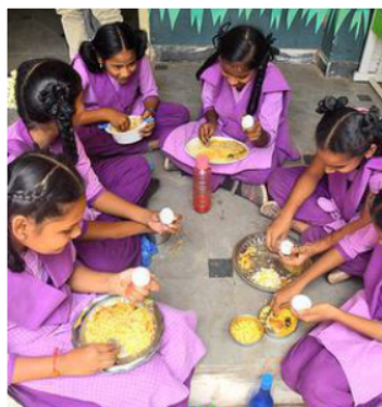
Structured food education and balanced menus can transform lunch into a launchpad for lifelong health. FILE PHOTO

There are a few things feeding into this trend – rising childhood obesity, less physical activity, and a lifestyle that has shifted indoors and online. But if we had to name the biggest culprit, it would